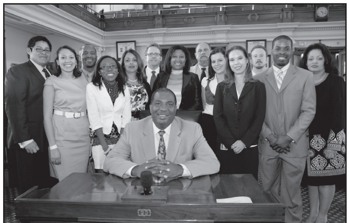
Team West - Senator West joined at floor desk by capitol, district and committee staff and interns that worked during the 82nd Legislature.