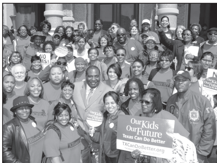
Senator West pictured on the Capitol steps with Dallas-area teachers during March 14, Statewide AFT Teacher Rally supporting public education.

Of District 23 schools, the Dallas ISD will be hit hardest. A 3.1 percent cut for FY11-12 will cost about $35.4 million. In FY12-13, the Dallas district will lose $99 million (8.6%). Cedar Hill schools will lose about $2 million (3.4% less) for FY11-12 and will spend about 5 percent less in FY12-13. The district will also close a campus. Duncanville schools stand to lose more funding for FY11-12 ($2.2 million) than for FY12-13 ($1.2 million). The DeSoto school district follows a similar