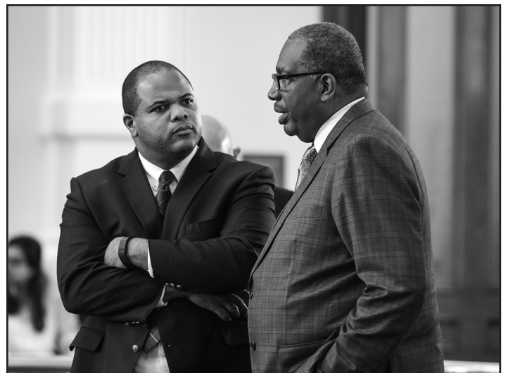
Sen. West chats with Rep. Eric Johnson who was later elected Dallas Mayor.

In November 2019's Constitutional Amendment Election, voters can approve SJR 4 to enact the Flood Infrastructure Fund which would make local jurisdictions eligible for no- or low-cost loans to be used for future flood mitigation planning and projects.