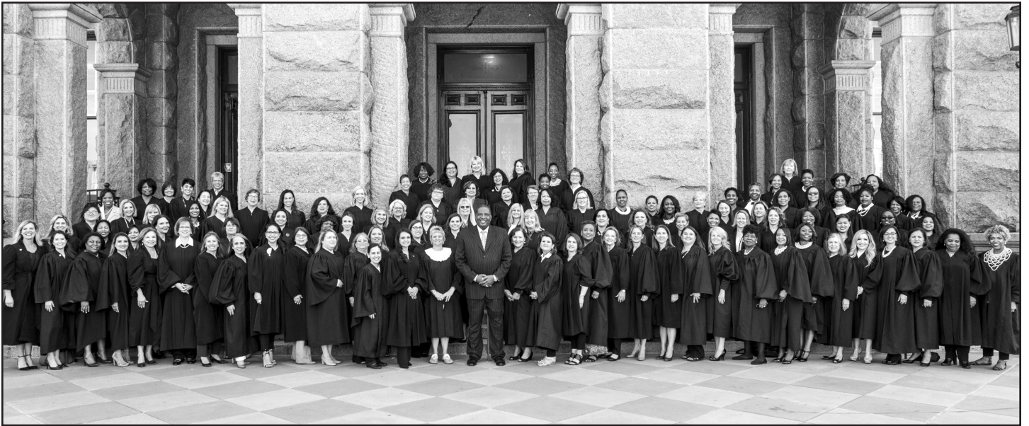
In April, women judges from across Texas were invited to the Capitol for recognition by Sen. West.

While we provided free pre-K under HB3 , obstacles still exist, including the requirement that families who are eligible for 3-year-old pre-K must re-establish eligibility for their 4 year-olds to attend. But many times, the family's information has not changed.