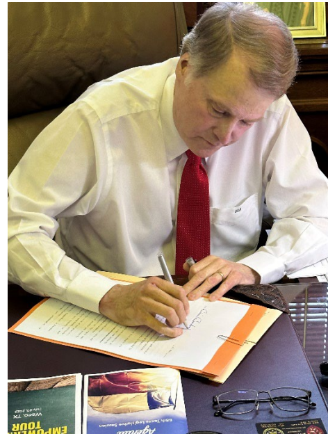
Signing our first several Senate Bills and Joint Resolutions before filing.