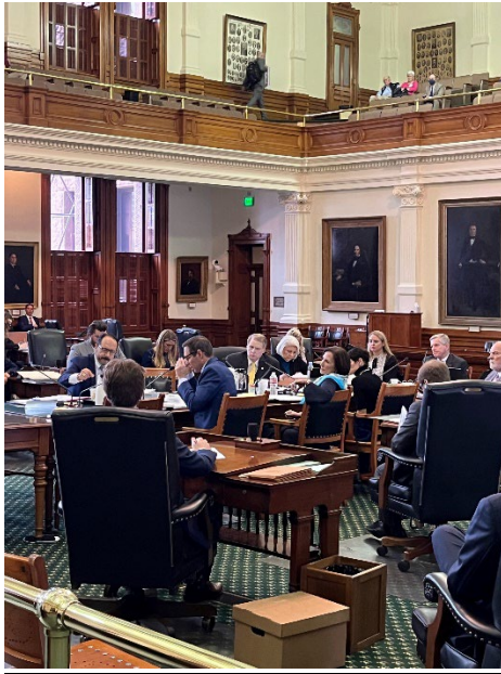
Listening in on the first Business & Commerce Committee hearing for the session on 2/7/23.

Greetings from your Texas Capitol! It's a busy time for us here at the statehouse in Austin. The Senate Finance Committee is actively working on the 2024-25 biennial state budget, the Senate Business and Commerce Committee has started hearings continuing their interim talks about the grid and Texas electricity market design, and legislators are actively filing new bills each day. We'll get into all of that and more in this edition of our Capitol Update.