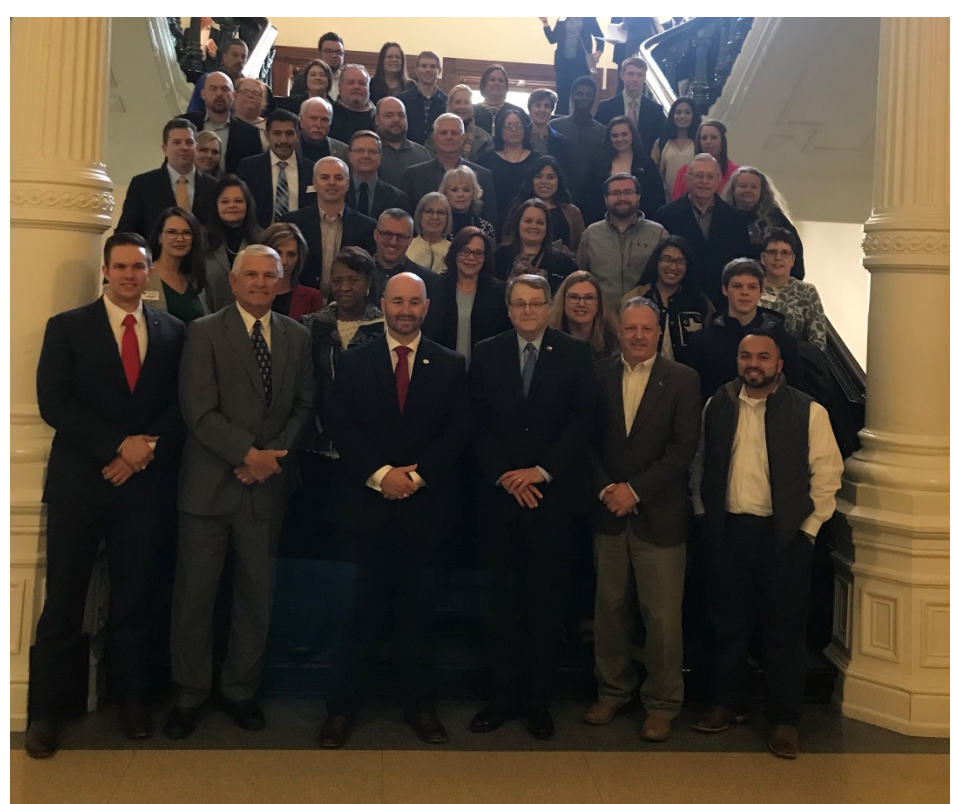
Citizens from Navarro County visiting the Capitol to discuss legislative issues with State Representative Cody Harris (R-Palestine) and myself on "Navarro County Day."

Greetings from <u>your</u> Texas Capitol! Things have been so busy in Austin these past two weeks with committee hearings starting and Gubernatorial declared emergency items coming up on the Senate floor, so I have much to share. Let's dive right in.