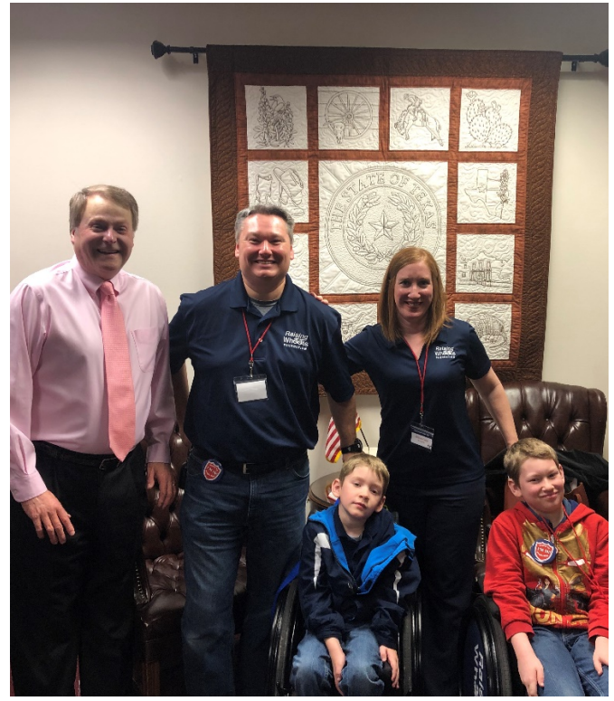
Meeting with the Copp family from Waco discussing the unique challenges of families with special needs children.