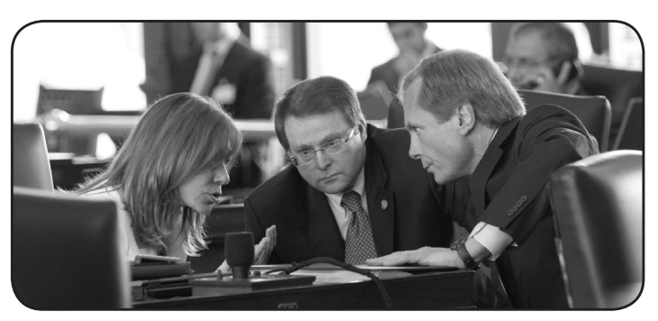
Senator Birdwell discussing legislation with Lt. Governor David Dewhurst and Senator Joan Huffman.