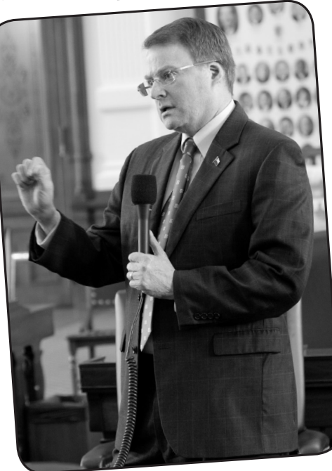
Brian Birdwell State Senator, District 22