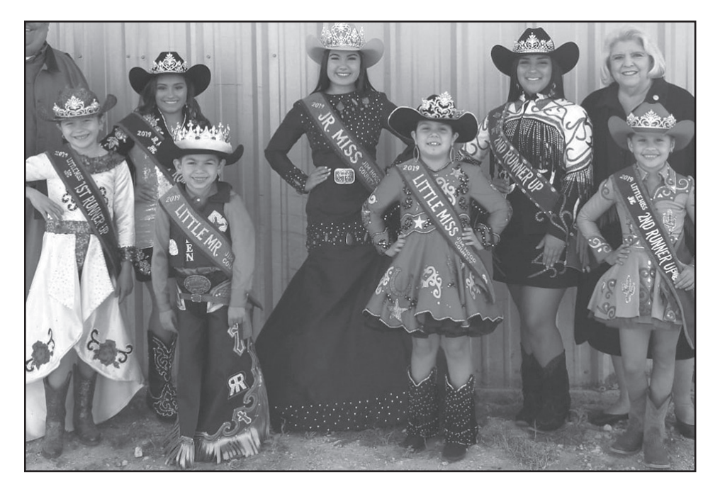
LOCAL TRADITIONS such as the Hebbronville Annual Vaquero Festival reflect the rich diversity of 18 counties in Senate District 21. Senator Judith Zaffirini admires the intelligence and poise of the young pageant royalty who honor our vaquero heritage proudly.

Hablando se entiende la and her staff receive inquiries gente (Through communication, about a multitude of subjects, requests, for example, she we understand each other) many of the most pressing ones exemplifies Senator Judith involve projects that threaten a Zaffirini's approach to addressing community's air, water or soil