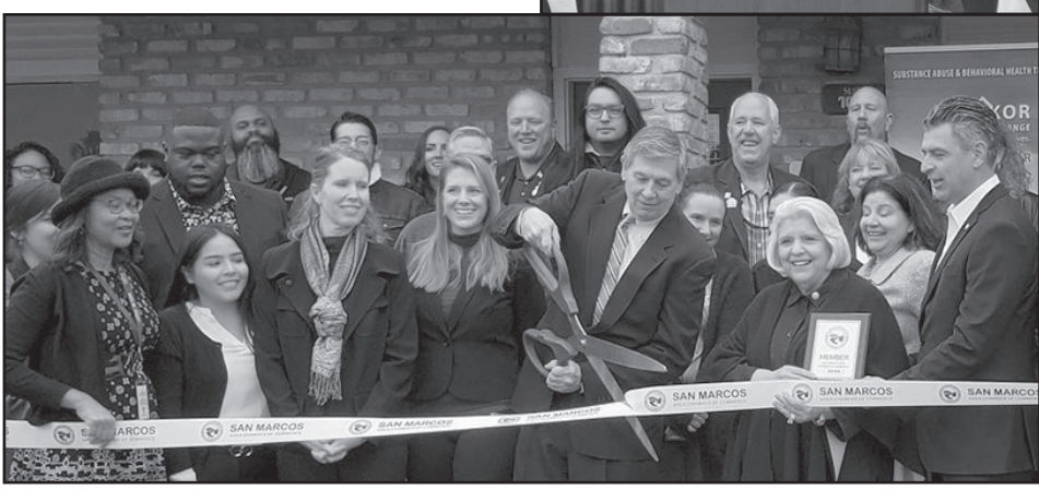
ATTENDING COMMUNITY EVENTS allows Senator Judith Zaffirini to meet with constituents of all ages. She joined students at Del Valle High School (top) to celebrate the new school year and leaders in San Marcos (bottom) to open a youth community center.

Page 2, Senator Zaffirini Reports, 2020-2021 Senator Zaffirini Reports, 2020-2021, Page 3