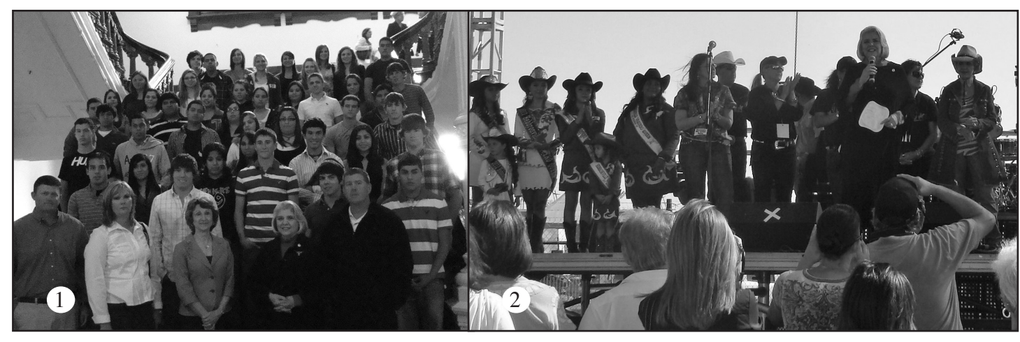
STUDENTS OF ALL AGES are among Senator Judith Zaffirini's most important stakeholders as she considers legislation related to education. Three Rivers High School students (left), for example, are among those who toured the Capitol during the last legislative session. Senator Zaffirini also enjoys participating in SD 21's many delightful local traditions, such as the annual Hebbronville Vaquero Festival in Jim Hogg County (right).