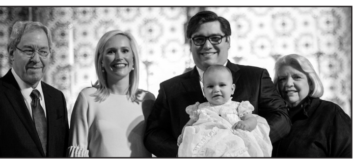
nication and a Distinguished Hispanic Alumna; awarded her the Presidential Citation; and inducted her into

The highest-ranking woman and Hispanic member of the Texas Sen-