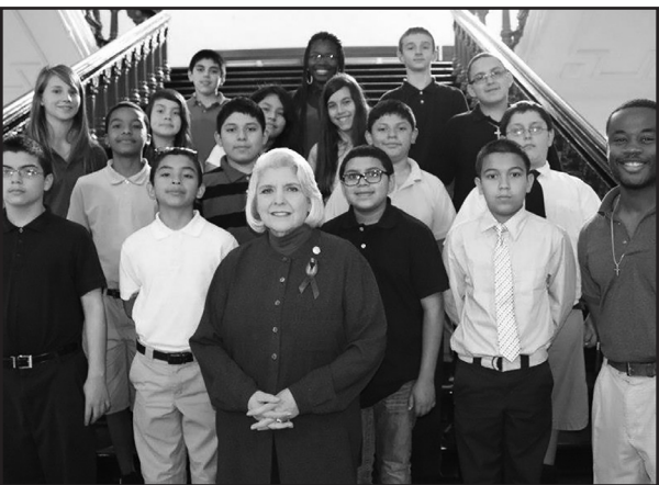
LOCAL ORGANIZATIONS dedicated to the public good are the backbone of every community. Members of the Boys and Girls Clubs of South Central Texas from Havs and Potential legislation also Caldwell counties are among those who provide helpful inwould create specialty sight and information to Senator Judith Zaffirini.

Senator Zaffirini maintains an open door policy at both her Capitol and district offices in Austin and Laredo, welcoming constituents to submit ideas or discuss potential concerns. "My constituents elected me to be their voice in the Texas Senate," she stresses, "which is why I take my duties so seriously."