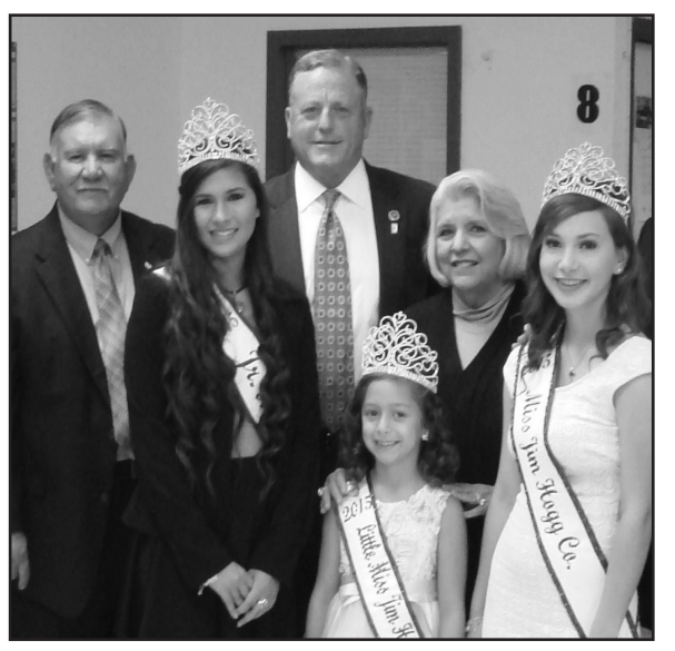
JIM HOGG COUNTY Judge Humberto Gonzalez, Department of Public Safety (DPS) official Paul Watkins and County Fair Royalty join Senator Judith Zaffirini to enforcement, however, celebrate the grand opening of a new DPS office.

The bill was passed twice by the Senate, but died in the House of Representatives both times. The senator is expected to file it again, and stakeholders agreed to join a Texas Parks and Wildlife Department task force to identify ways to control illegal behavior, improve public safety, safeguard private property rights and conserve environmental quality along the river.