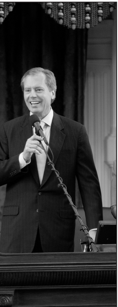
"Texas is the place where every day, anybody from any background or community can scale heights as improbable as they are breathtaking."