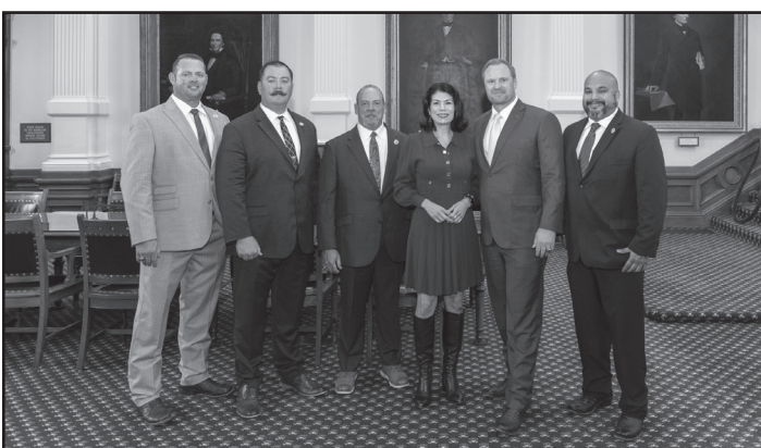
Senator Alvarado with Texas firefighters.

Senator Alvarado passed 38 bills total this session; three were vetoed.