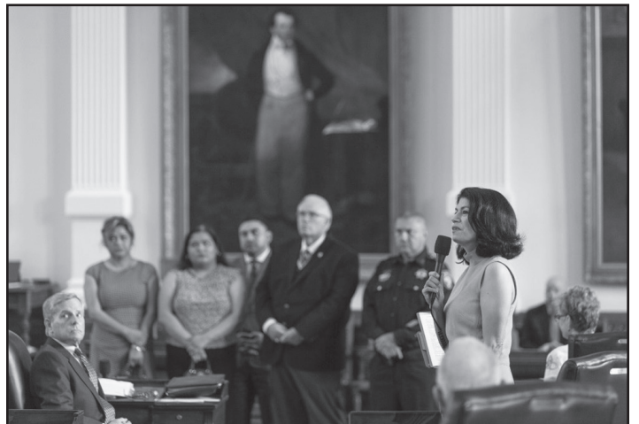
Sen. Alvarado with the Almendarez family & State Rep. Armando Walle, honoring the life of Deputy Darren Almendarez on April 3, 2023. Later that day, Sen. Alvarado passed SB 224 (the Deputy Darren Almendarez Act) to combat dangerous catalytic converter thefts.

SB 855 increases judicial training on domestic and family violence