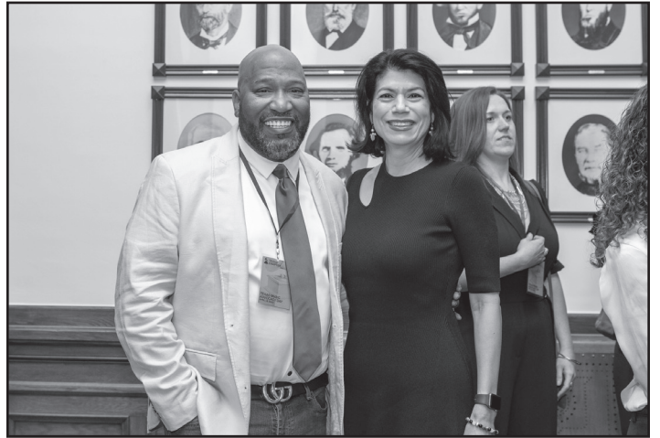
Senator Alvarado with Houston rap legend Bun B as an invited guest to the Senate.

SB 1965 introduces an important change requiring the Public Utility Commission to implement a streamlined process for the quick sale, transfer or merger of utilities. A direct response to an incident that occurred in Senate District 6, this bill provides communities with the peace of mind that their essential water services are no longer at risk. It ensures a smoother transition between owners, guarantees access to vital utilities and safeguards the well-being of affected communities.