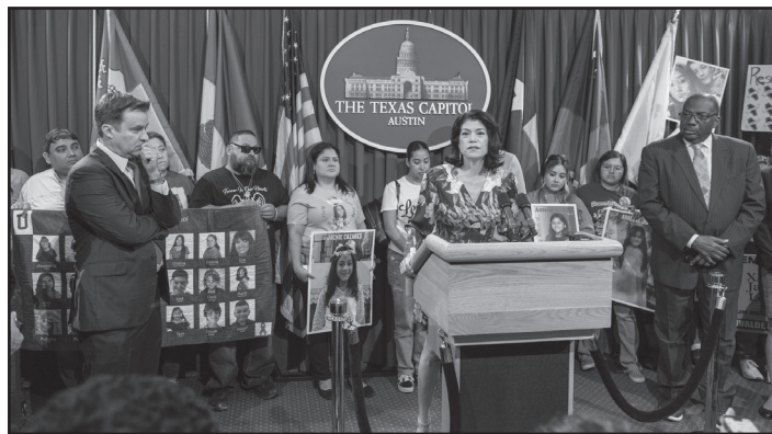
Sen. Alvarado with the families of those killed at the Uvalde school massacre, advocating for responsible gun reforms like raising the age to buy assault weapons to 21. Also pictured are Senators Roland Gutierrez & Royce West.

HB 3 establishes a school safety plan that requires armed guards to be present on all public school campuses and district employees to complete mental health first aid training. Additionally, the bill allocates $10 of funding per student plus $15,000 per campus for the implementation of these school safety measures. HB 3908 requires public schools to provide research-based instruction on fentanyl abuse prevention and drug poisoning awareness to students in grades six through twelve. SB 2139 establishes the Opportunity High School Diploma program for drop-out students to earn a high school diploma at a public junior college while enrolled in a workforce program. HB 900 requires book vendors working with public school libraries to assign ratings to books based on the presence of sexually explicit references or depictions. HB 1615 authorizes the Texas Workforce Commission to administer a program for private childcare providers to partner with public school districts and charter schools to offer free pre-K.