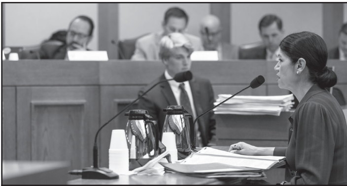
Senator Alvarado lays out a bill in the Senate Business and Commerce committee.

Each committee focuses on different topics. The Transportation Committee handles bills about statewide and local transportation laws. The Administration Committee decides when local and uncontested bills will be scheduled for a floor vote. The Natural Resources and Economic Development Committee handles a wide range of issues including oil and gas, the environment, affordable housing, workforce development and tax incentives to help our local communities and economies. The Nominations Committee gives approval for the governor's appointments to important state offices. The Senate Special Committee on Redistricting meets when it is time to redraw the state's maps for the legislative, congressional and the State Board of Education districts.