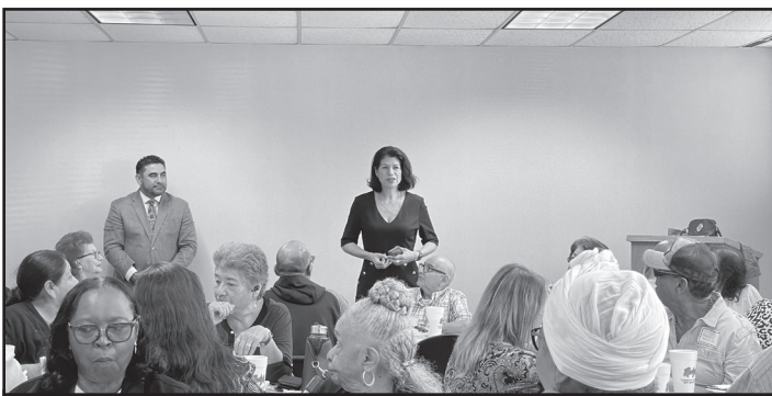
Senator Alvarado discusses her legislative priorities with Aldine constituents at the Capitol. Also pictured is Rep. Armando Walle.

SB 1397 reauthorized the Texas Commission on Environmental Quality for 12 years while making improvements to the agency to ensure more transparency and public participation. Senator Alvarado added an amendment to this bill that ensures Texans are given more time to submit contested case hearing requests for proposed concrete batch plant permits. Senator Alvarado also advocated for a TCEQ rule change to give Texans additional opportunity to contest concrete batch plant permits. This rule change will become effective in fall 2023. SB 1648 and SJR 74 created the Centennial Parks Conservation Fund, investing $1 billion dedicated to the creation of new state parks if voters approve this November. SB 2127 , SB 1017 and SB 784 prohibit cities from enacting ordinances that attempt to regulate environmental issues, gas-powered equipment and greenhouse gasses. SB 28 created the New Water Supply for Texas Fund to help develop water supply projects that create new water sources for the state. HB 1500 reauthorized the Public Utility Commission of Texas, the agency charged with overseeing the Texas electricity market, until 2029. SB 2627 created a fund to encourage the construction, maintenance and operation of natural gas and power plants in Texas. Renewable energy facilities, such as solar and wind plants, are not eligible to receive money from this fund.