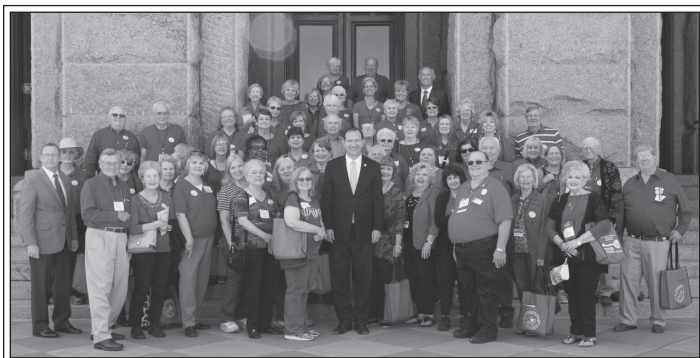
Visiting with constituent members of the Texas Retired Teachers Association.

We also worked to create a Texas Commission on Public School Finance tasked with studying our school finance system and making recommendations regarding what steps the legislature can take to make school finance more equitable and efficient. The Commission is composed of high-profile leaders in education, business, and civic engagement, as well as members of the House and Senate, and a member of the State Board of Education.