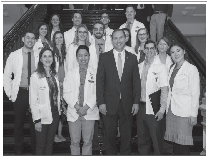
Discussing healthcare with medical professionals from Senate District 5.

Last January, Governor Abbott named Child Protective Services an “emergency item” for the Legislature, allowing bills affecting the CPS system to be “fast-tracked” through the legislative process. I authored Senate Bill 11, a bill that strengthens investigations of abuse and neglect for children and families, revamps the foster care system to ensure active and ongoing community engagement and support, and ensures children in the care of CPS receive timely and appropriate services.