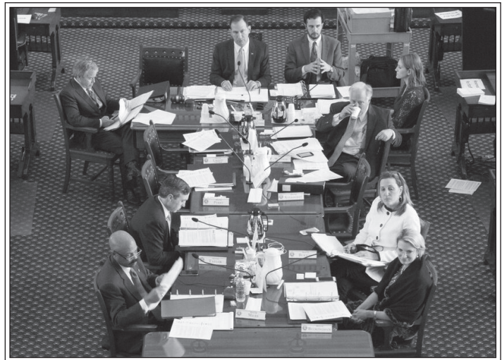
The Senate Committee on Health and Human Services hearing public testimony in the Senate chamber.

In a growing state like Texas, we must always be looking for ways to improve our public schools and give our children the best possible foundation for future success.