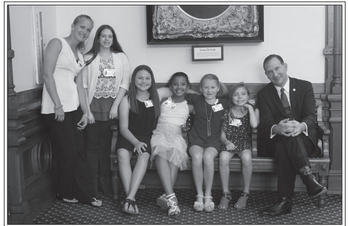
Visiting with Senate Pages from Freestone County.

As a father with three boys in public school, I am utterly heartbroken for the families who lost loved ones in the tragic school shooting at Santa Fe High School. Texas children shouldn't be afraid to go to school and Texas parents shouldn't have to worry about whether or not their kids are safe from these acts of senseless violence.