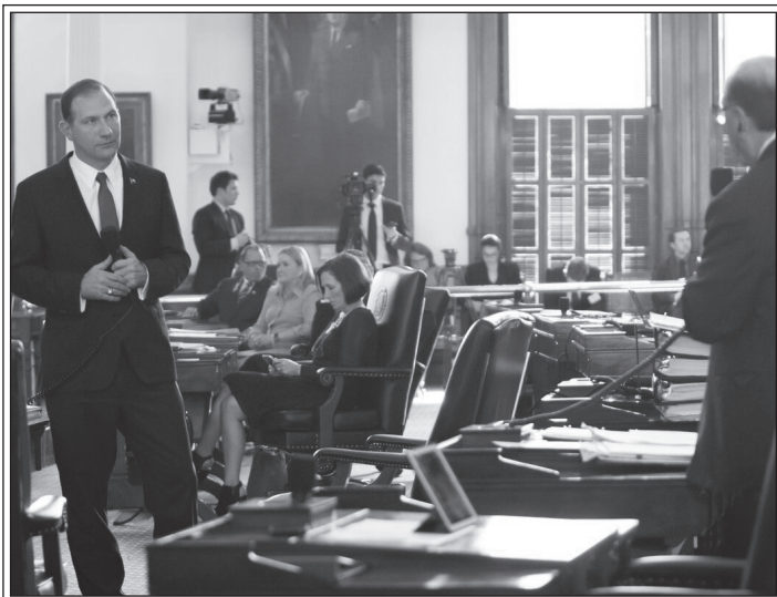
Discussing legislation on the Senate floor.

I am proud of our work as a Legislature passing a conservative, balanced budget that meets the needs of our state without raising taxes.