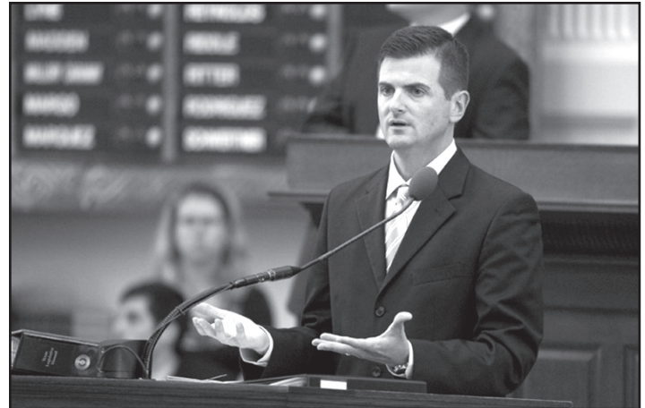
Senator Creighton addresses the House of Representatives during the 83rd Legislative Session.

The current suit regarding Texas school finance is waiting for a hearing before the Texas Supreme Court. For decades now Texas has been in a reactionary cycle of tweaking