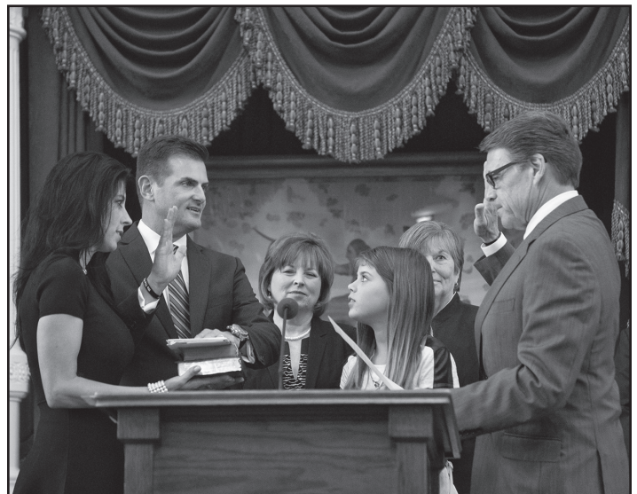
Senator Creighton with his family as Governor Perry administers the oath of office.

These interim hearings play a big part in preparing for the upcoming legislative session. They provide good information on potential issues facing the state and possibly the nation. As a national leader in many subject areas, Texas must remain on the cutting edge even though the Legislature only meets every two years. Participating in interim hearings is a good way to stay current on pressing issues and ensure that legislators and other state leaders are engaged in moving our state forward.