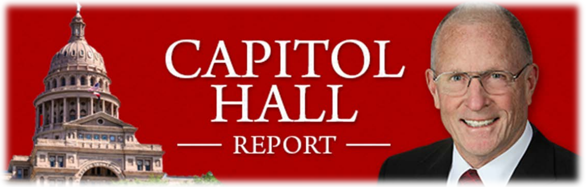
Currently Serving the counties of District 2: Fannin, Delta, Hunt, Hopkins, Rains, Rockwall, Kaufman, Van Zandt, and part of Dallas County