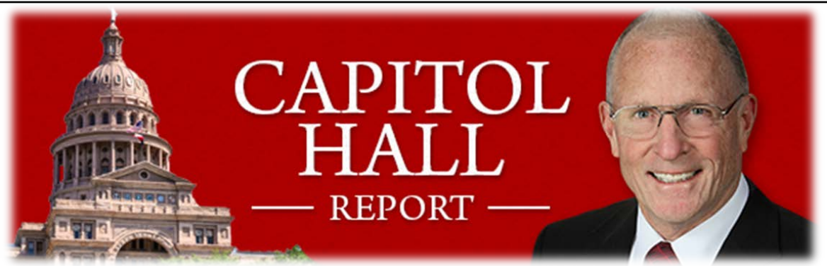
Currently Serving the counties of District 2: Fannin, Delta, Hunt, Hopkins, Rains, Rockwall, Kaufman, Van Zandt, and part of Dallas County