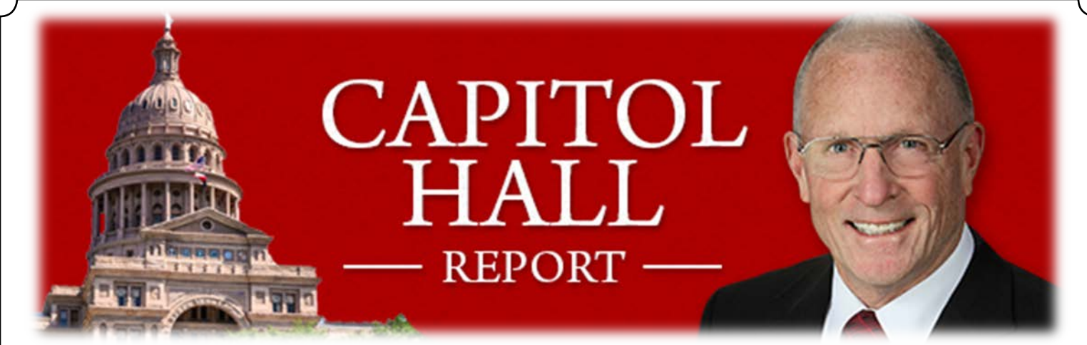
Serving the counties of District 2: Fannin, Delta, Hunt, Hopkins, Rains, Rockwall, Kaufman, Van Zandt, and part of Dallas County