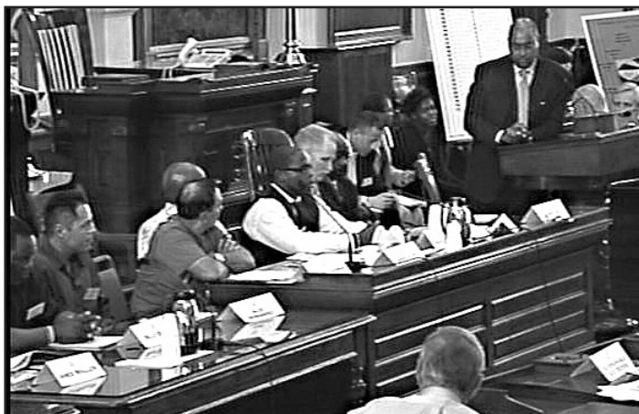
Senator Ellis discusses key reforms with nine wrongfully convicted Texans, and criminal justice experts at a historic gathering in the Texas Capitol.

Texas leads the nation with 34 wrongful convictions proven by DNA. This shameful statistic is clear and convincing evidence that our criminal justice system is broken, and it's time we took the necessary steps to fix it. In that spirit, Senator Ellis has taken on the responsibility of chairing the board of the Innocence Project, and continues to advocate legislative reforms dedicated to ensuring Texans have a system of justice they can have confidence protects the innocent, brings the guilty to justice, and is instilled with the fairness and integrity that justice demands.