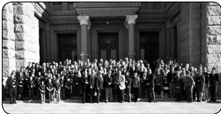
Constituents visit the Capitol for Chambers County Day.

wait, the more likely you will be stuck in evacuation traffic. If you are elderly or disabled and need evacuation assistance, please call 2-1-1 . For more detailed information go to www.txdot.gov/travel/hurricane.htm , or call Tommy's office for information.