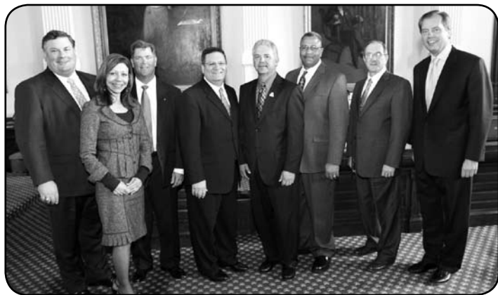
Tommy, Sen. Huffman, and Lt. Governor Dewhurst with local chamber officials as they are recognized on the Texas Senate floor on Golden Triangle Days.